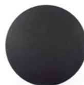
black grill (option)